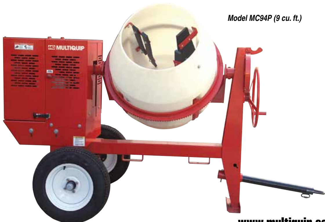
Model MC94P (9 cu. ft.)

Our tough polyethylene drums can be cleaned in minutes. A simple tap with a rubber mallet does the job — without dents, rust or cracks!