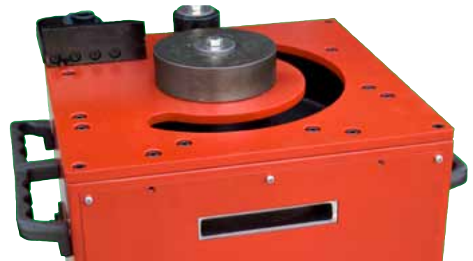
Enclosed clean-out slot prevents rebar shavings from falling into the housing.