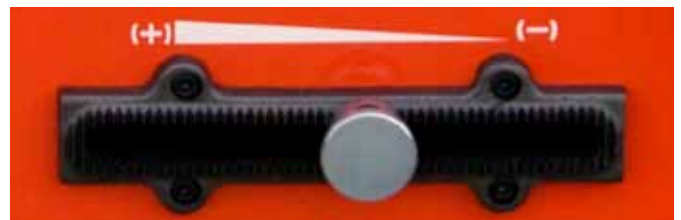
Angle adjustment knob allows fine tuning of bending angle.