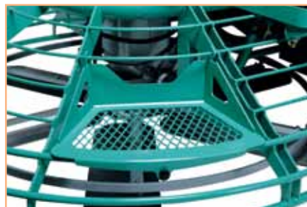
Removable steps provide quick access to trowel blades