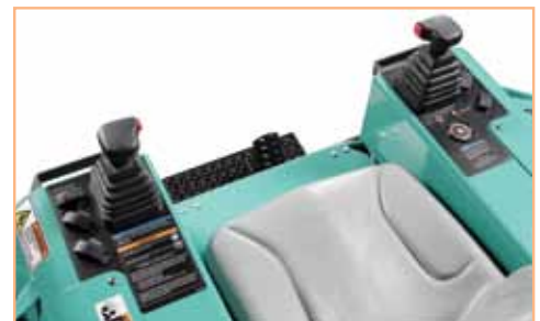
Operator Controls are ergonomically designed and positioned for ease of use.