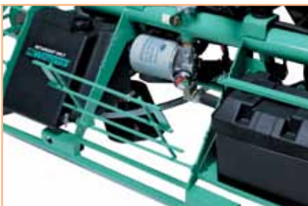
Hinged panels make servicing easy by allowing quick access to filters and trowel blades