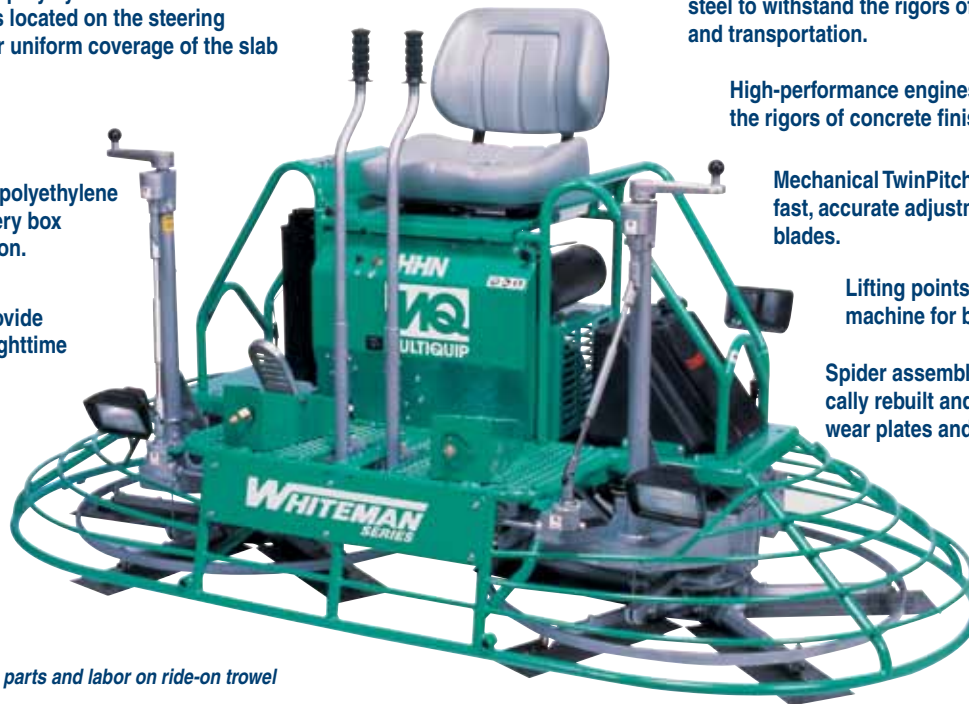
(HHN shown. Called-out features typical of all mechanical trowels.)

Spider assemblies can be economically rebuilt and feature long-lasting wear plates and spider hubs.