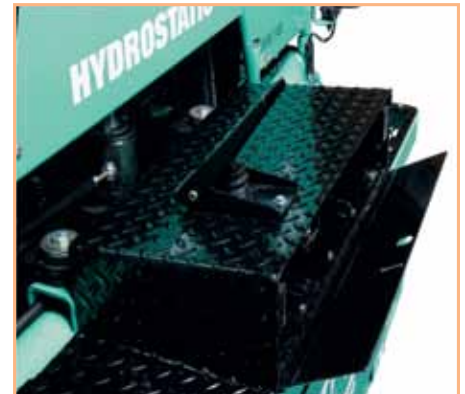
Raised operator's platform includes lockable storage compartment