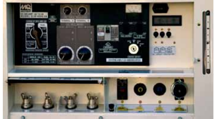
Full instrumentation is protected by a vandal proof cover. LED display provides clear readout of load characteristics.