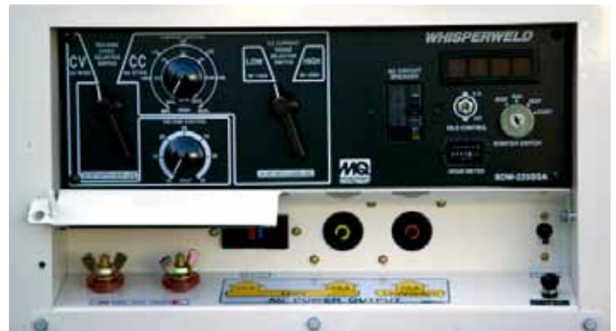
Full instrumentation including controls for both CC and CV welding.