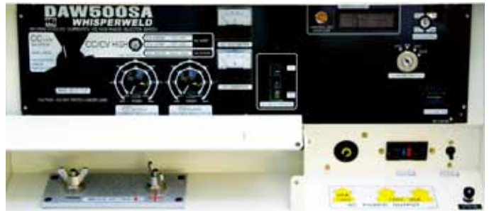
Full instrumentation includes DC voltmeter and ammeter.