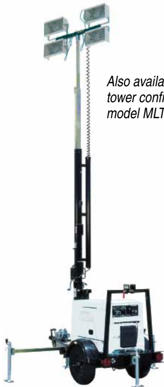
Also available in light tower configuration as model MLT-SDW7