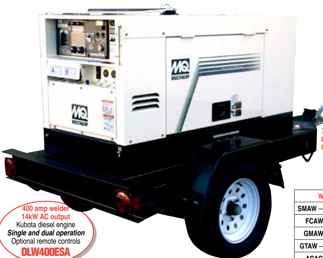
The DLW400ESA allows two welders to work simultaneously — each with his own remote control.