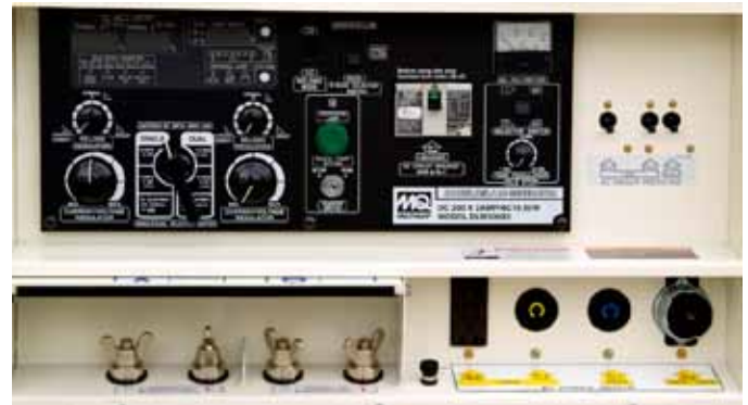
Full instrumentation is protected by a vandal proof cover. LED display provides clear readout of load characteristics.