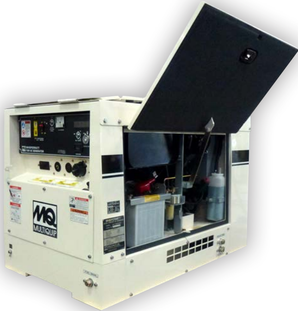
Model: DA7000SSA2GH Modified for single side serviceability

Single side service access is standard in the model DA7000SSA2GH. A factory modification relocates the oil-filter assembly and enables all service points (fuel filter, oil filter, battery, coolant, air filter and drains) to be accessed from the same side of the generator. It is recommended for applications where the generator will be permanently mounted on equipment or installed in an area with obstructed access to the cabinet.