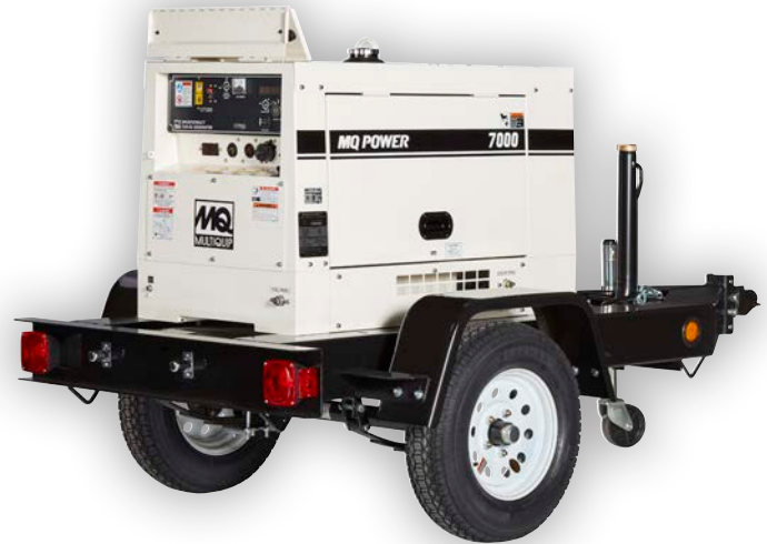
Model: DA7000SSA2 shown with optional trailer mount