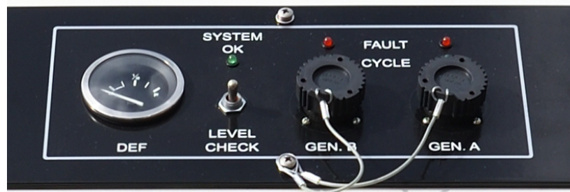
DEF Control Panel