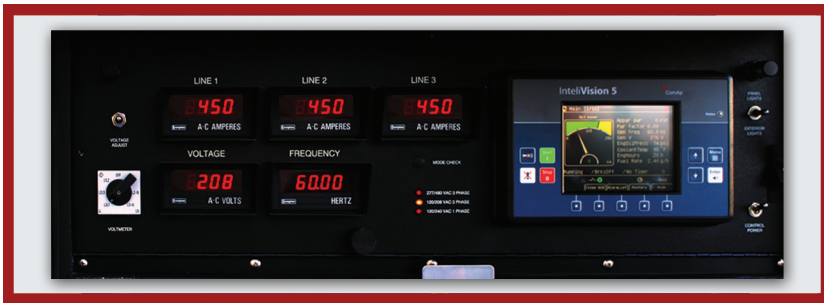
Quick-read LED instrumentation