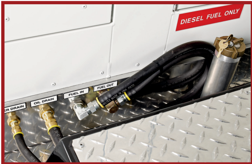
Engineered to simplify service and maintenance