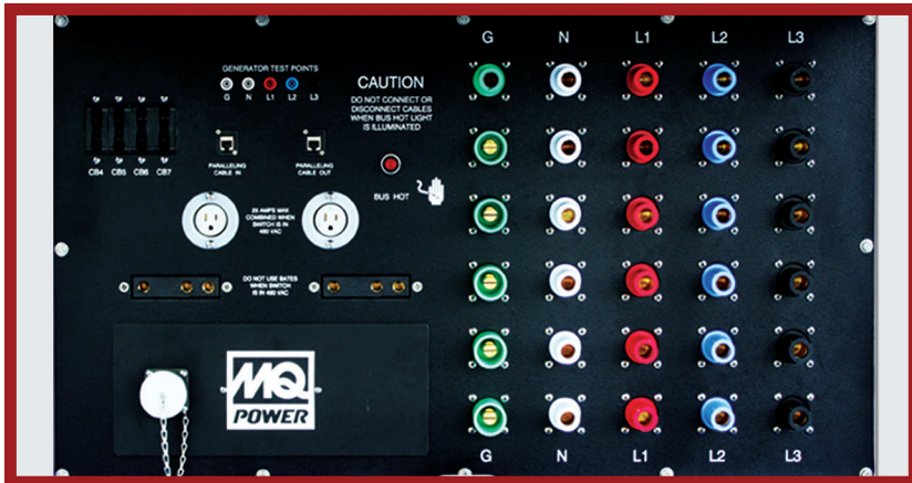
Multi-configuration connection panel