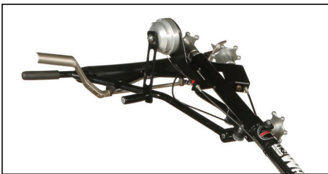
Height adjustable handle and location of all controls ensure operator comfort.