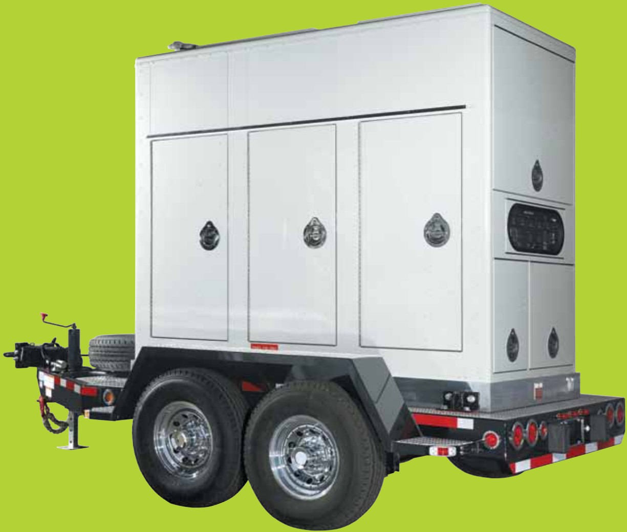
[ EGS1800C3H ]