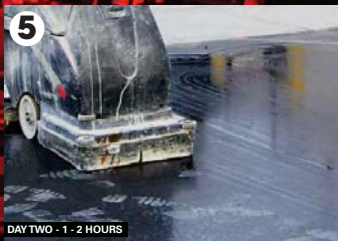
DAY TWO - 1 - 2 HOURS

Step 2 is applied once power troweling is completed and worked in with a foxtail broom, keep surface wet with product for 30 minutes.