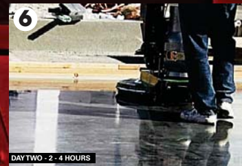
DAY TWO - 2 - 4 HOURS

At the completion of major construction, but prior to delivering the project to the owner, surface is cleaned with an auto scrubber and water.