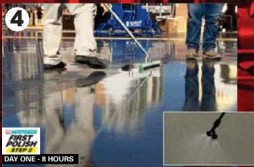
DAY ONE - 8 HOURS

The floor is troweled until the desired level of burnish/finish is achieved.