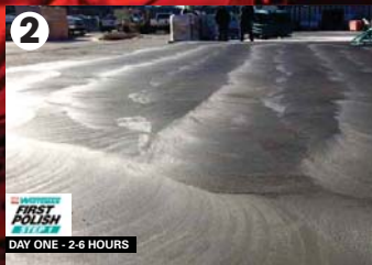
DAY ONE - 2-6 HOURS

Following screed application a check-rod is used to straighten the surface.