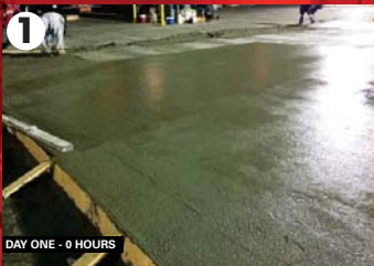
DAY ONE - 0 HOURS

Ideal applications include floors in retail showrooms, airports, museums, institutional facilities such as hospitals and government buildings.