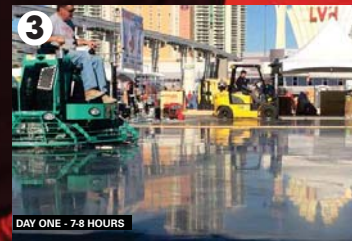
DAY ONE - 7-8 HOURS

With a rider trowel spray system Step 1 is applied 4 times during the floating process and worked completely into the surface using a trowel equipped with float pans.