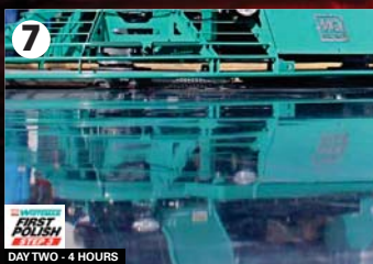
DAY TWO - 4 HOURS

Following use of auto scrubber surface is burnished with a black strip pad.