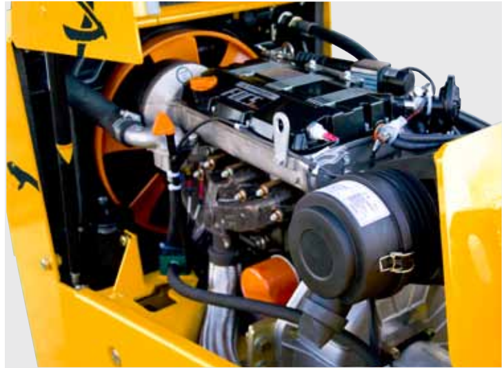
Liquid cooled Lombardini engine features idle control for improved fuel economy.

The Viper RX1510-series will change your opinion of articulated trench rollers. It features innovations such as an industry first Z-frame design, Straight Compaction Technology (SCT), and an oscillating articulation joint that requires zero maintenance. These are just a few of the engineering ideas that make up the smoothest steering articulated trench roller available today—the Viper RX1510-series—exclusively from Multiquip.