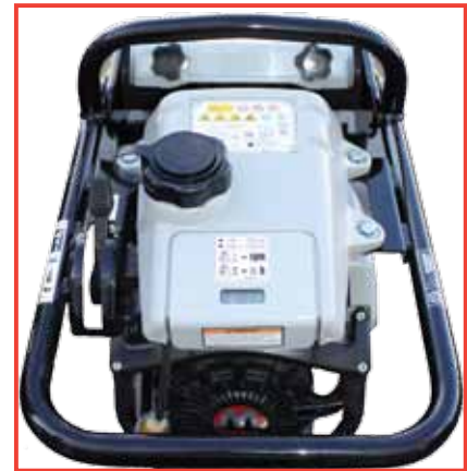
New EPA compliant fuel tank includes built-in tachometer & hour meter