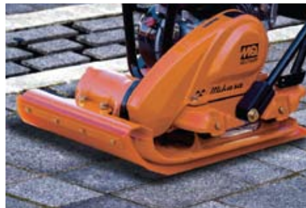
UPA88A Urethane plate attachment for use on paving stones and brick pavers