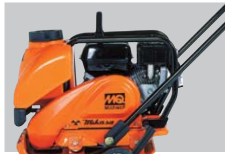
WHL88 Transport wheel kit