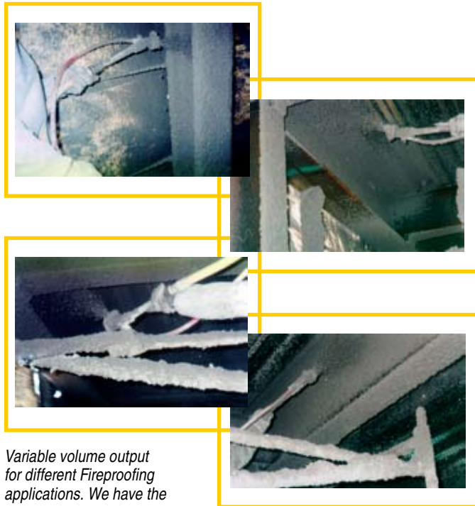
Variable volume output for different Fireproofing applications. We have the right pump for your job.