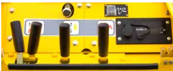
Complete instrumentation simplifies operation.