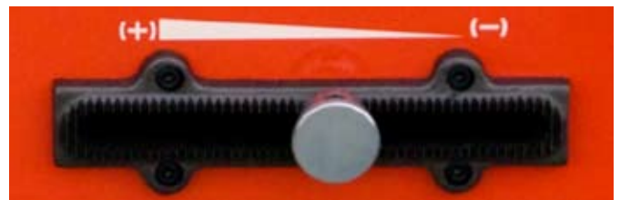
Angle adjustment knob allows fine tuning of bending angle.