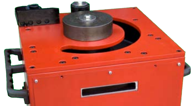
Enclosed clean-out slot prevents rebar shavings from falling into the housing.