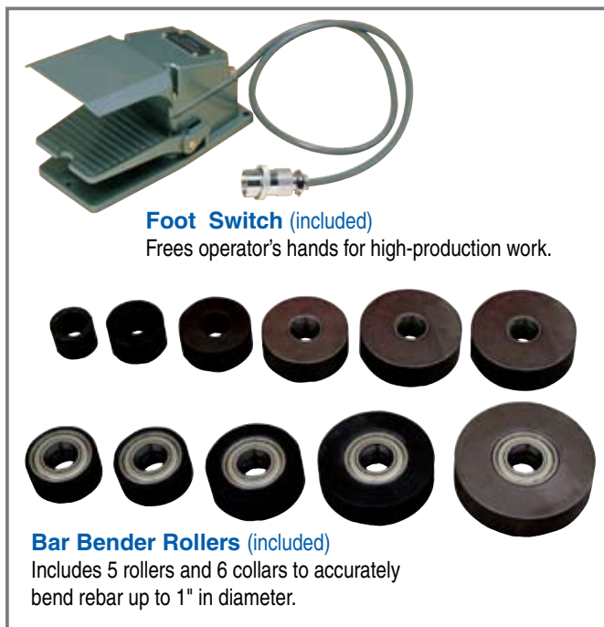
Foot Switch (included) Frees operator's hands for high-production work.