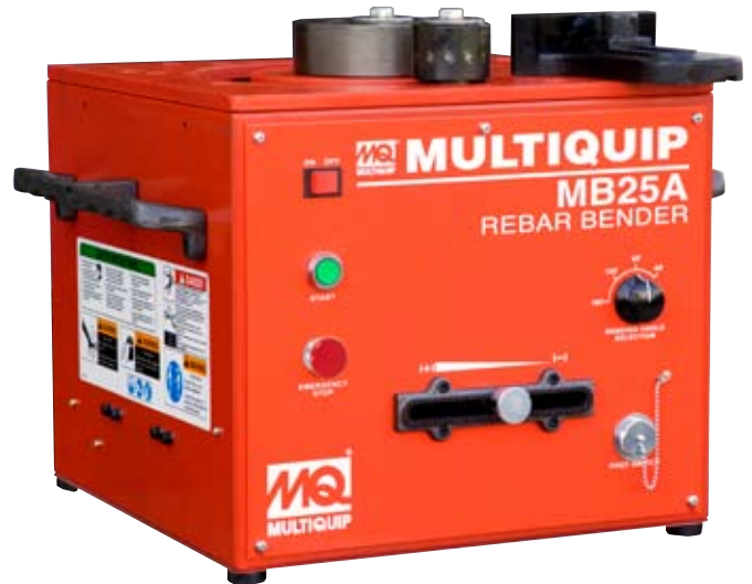
Model MB-25A can bend 1" rebar a full 180 degrees in just 5 seconds and handles up to 4 pieces of 1/4" rebar at a time.