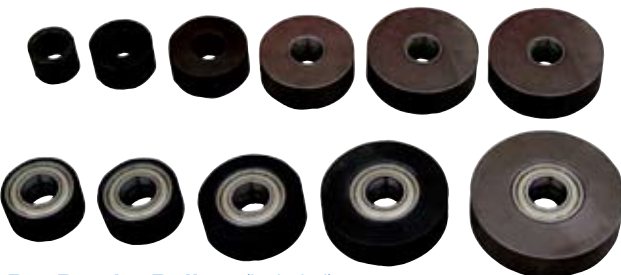
Bar Bender Rollers (included) Includes 5 rollers and 6 collars to accurately bend rebar up to 1" in diameter.