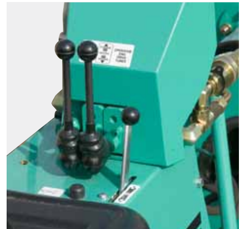
Precise alignment corrections are made with easy-to-use independent hydraulic steering controls. Shown with controller for gasoline engine.