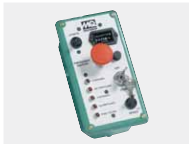
The diesel engine control panel provides all vital information with just a glance.