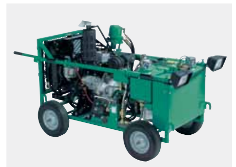
28-HP* liquid-cooled Vanguard diesel power pack