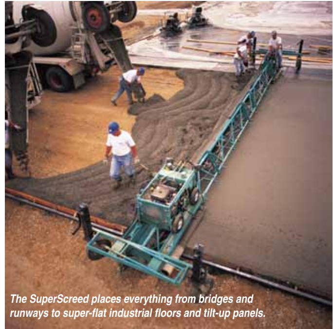
The SuperScreed places everything from bridges and runways to super-flat industrial floors and tilt-up panels.