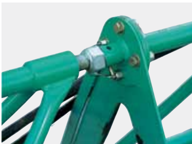
Valley crown adjustments lock in at every \frac{1}{16} ".