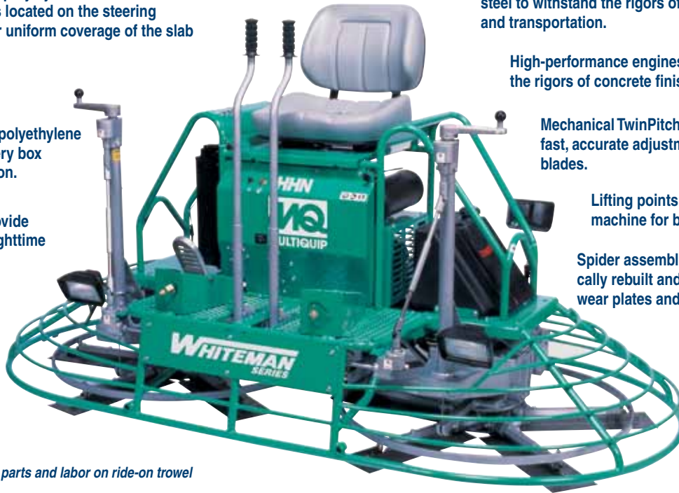
(HHN shown. Called-out features typical of all mechanical trowels.)

Spider assemblies can be economically rebuilt and feature long-lasting wear plates and spider hubs.