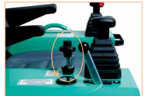
Rotor Speed Control allows the operator to set the rotor speed and reduces the amount of foot pedal travel to relieve fatigue during low speed panning