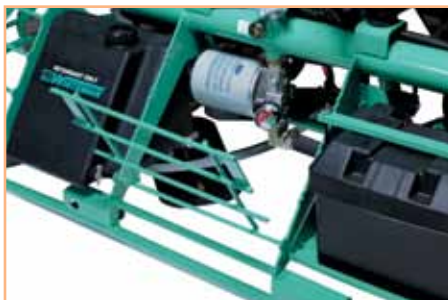
Removable panels make servicing easy by allowing quick access to filters and trowel blades