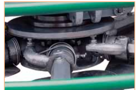
Spider assemblies feature long-lasting wear plates and spider hubs