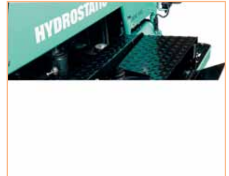
Raised operator's platform includes lockable storage compartment