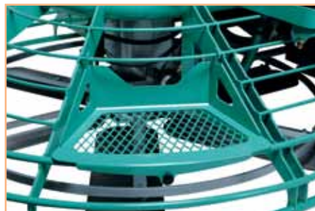
Removable steps provide quick access to trowel blades