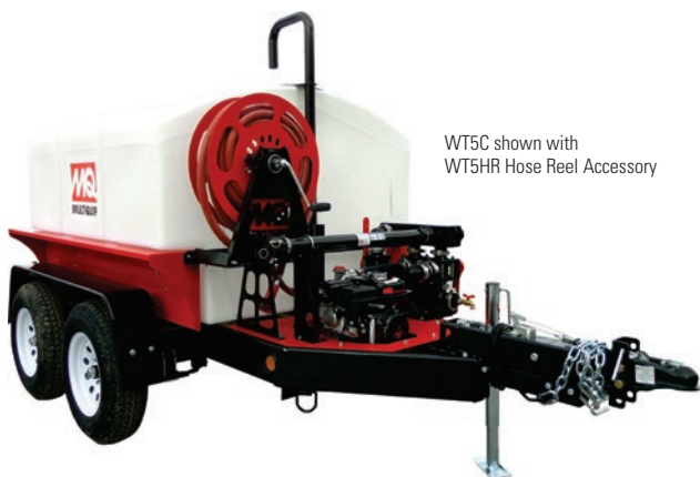
WT5C shown with WT5HR Hose Reel Accessory