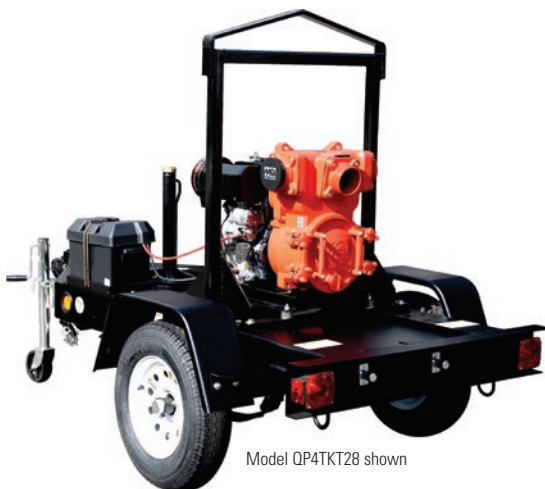
Model QP4TKT28 shown