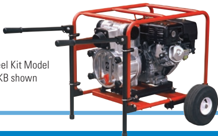
Wheel Kit Model UWKB shown

Industrial towable trailers with fuel cells are available for QP4TK, MQ62TK and MQ600HT models.