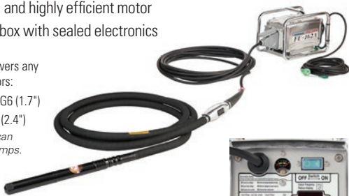
FU162A Control Panel

* Only ONE FX60E6 can be powered at 18 Amps.