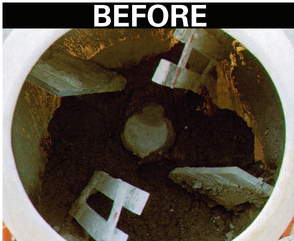
In all standard steel drum mixers, this dried concrete could be a nightmare to clean out...