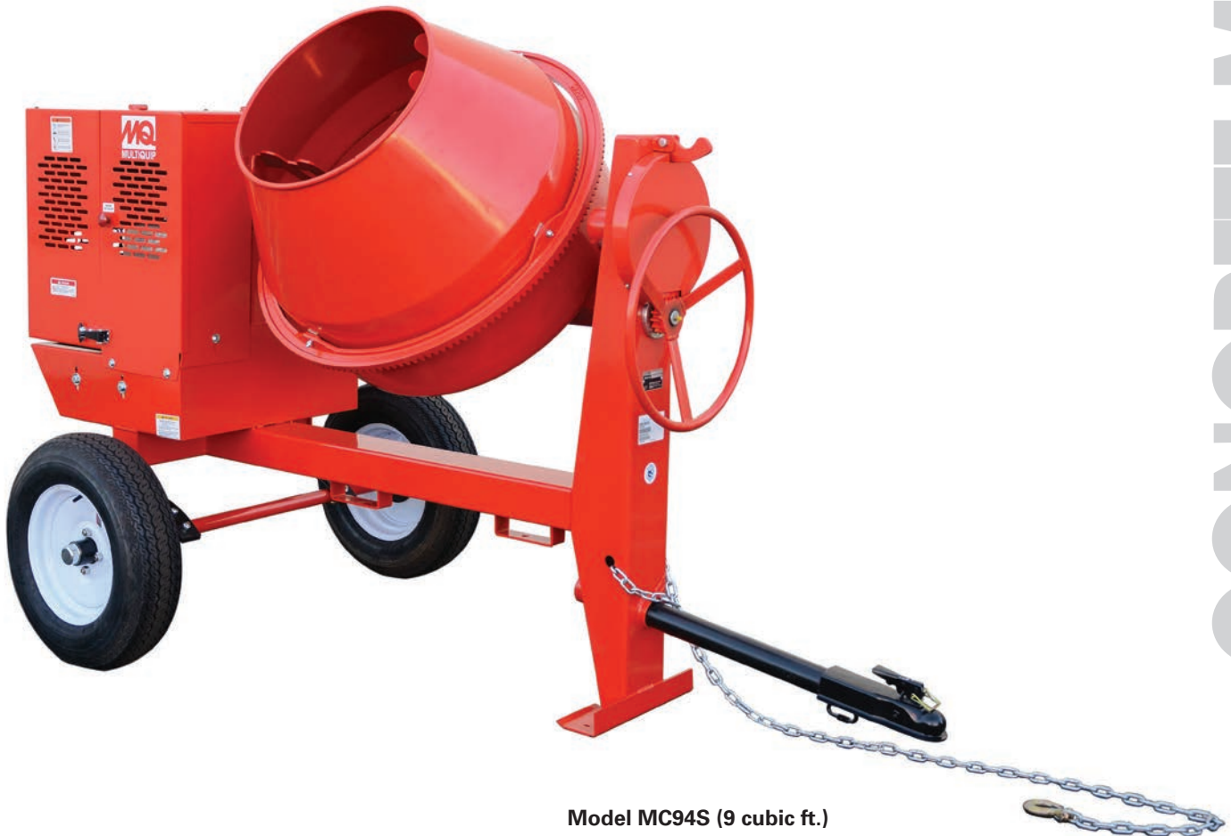
Model MC94S (9 cubic ft.)