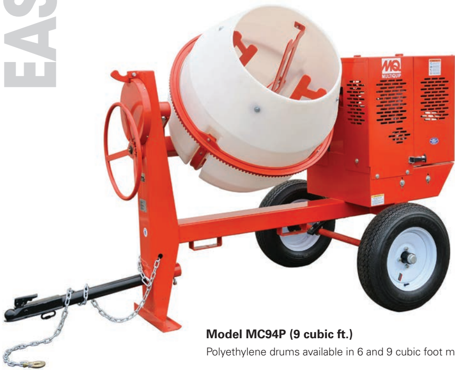
Model MC94P (9 cubic ft.)

The MC12PH concrete mixer handles your biggest and toughest applications. It features a 12 cubic ft. EasyClean™ drum and powerful Honda GX340 engine.