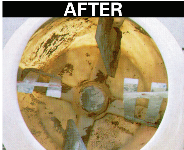
...but not with an EasyClean mixer! A few taps with a rubber mallet and the dried concrete falls right out!