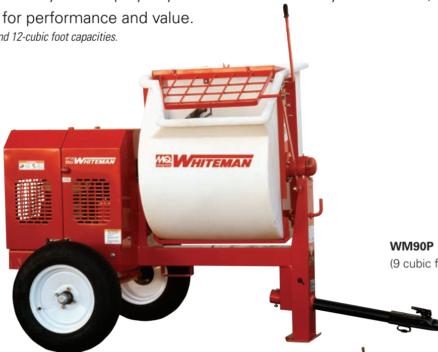
WM90P (9 cubic ft., Poly drum)

Models available in 7-, 9-, and 12-cubic foot capacities.