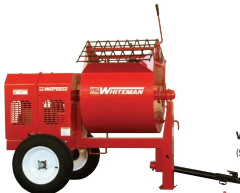
WM90S (9 cubic ft., Steel drum)