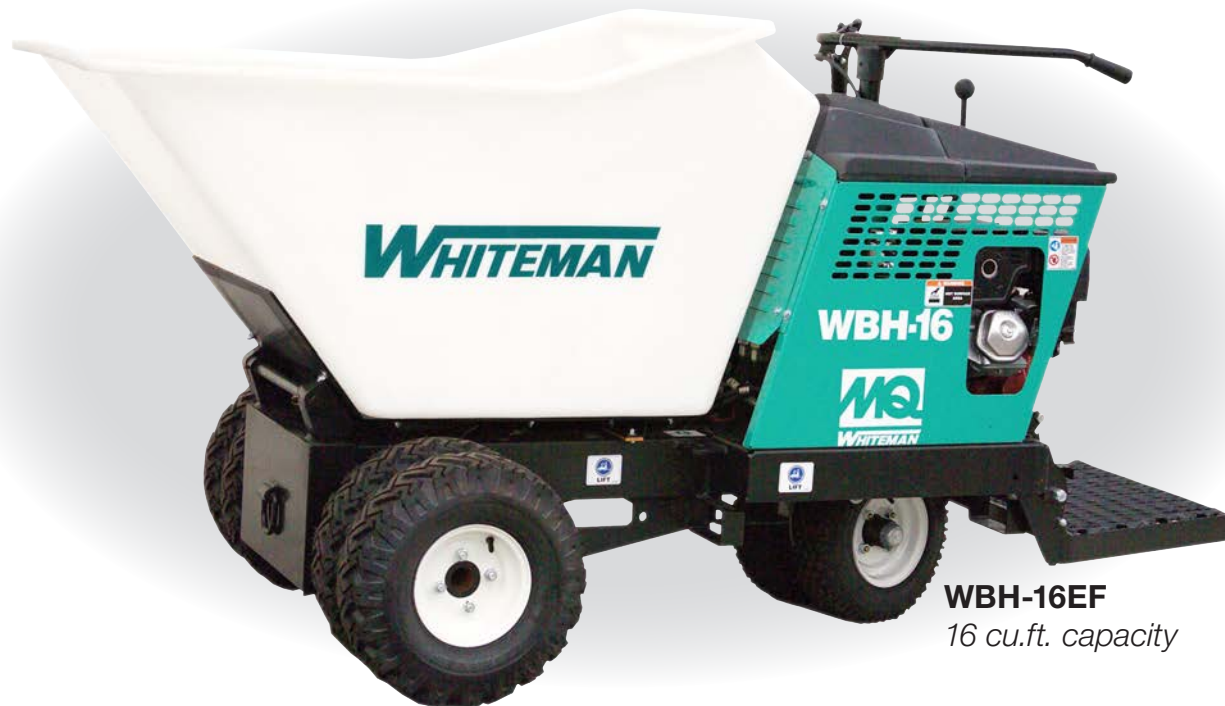
WBH-16EF 16 cu.ft. capacity