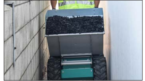
2.83 ft³ clip-on tub — TT7 — allows access through narrow 32-inch passageways.