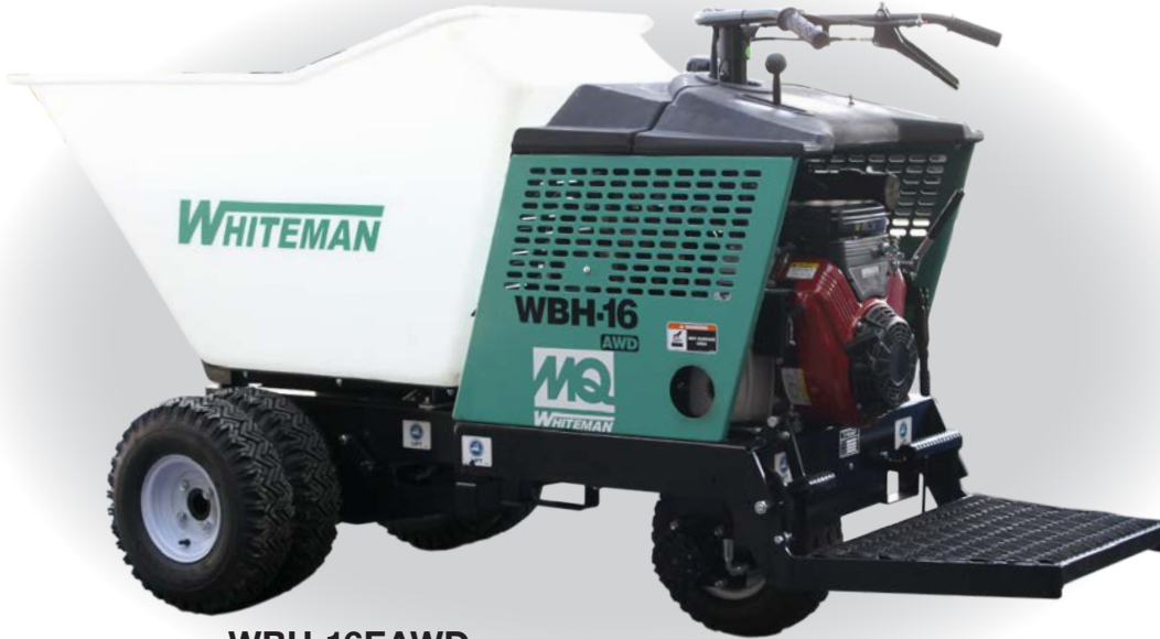
WBH-16EAWD 16 cu.ft. capacity Features electric start Vanguard engine

Heavy duty main frame provides structural integrity with low center of gravity for increased stability and traction.