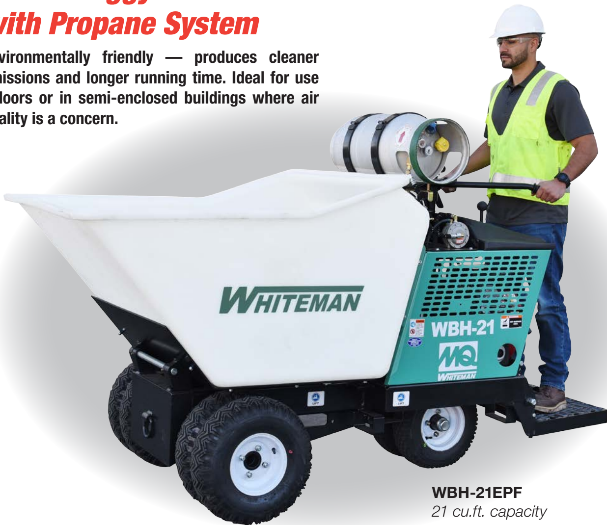
WBH-21EPF 21 cu.ft. capacity

Environmentally friendly — produces cleaner emissions and longer running time. Ideal for use indoors or in semi-enclosed buildings where air quality is a concern.