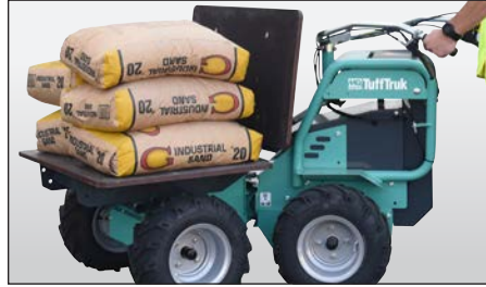
TuffTruk Flatbed — TFB33 and TFB29 — 33.4 or 29.0 inch width, ideal for transporting heavy bags of material.

TuffTruk Accessories for maximum versatility.