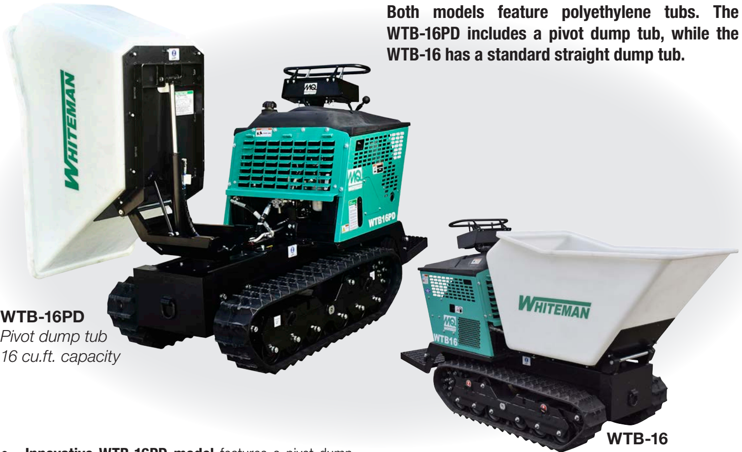
WTB-16PD Pivot dump tub 16 cu.ft. capacity

Both models feature polyethylene tubs. The WTB-16PD includes a pivot dump tub, while the WTB-16 has a standard straight dump tub.