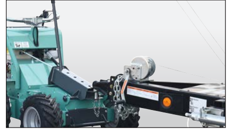
TuffTruk 2-Inch Towing Hitch — TTBH — offers various height positions for different size trailers.