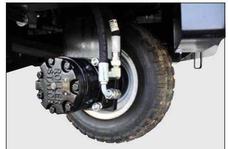
The All-Wheel Drive Buggy is equipped with a powerful steering drive motor for optimum performance. A single oversized tire provides superior traction.