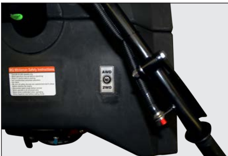
Toggle switch allows operator to easily switch from two-wheel drive to all-wheel drive.