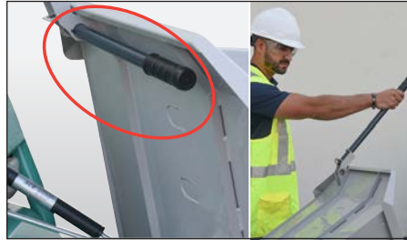
TuffTruk Dump Handle — TTH — steel tub; TTHP poly tub — for added convenience when discharging uphill.