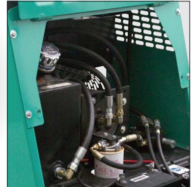
Quick Service Access Hinged access door for easy maintenance. Hydraulic hoses are located within the frame for fast access and protection.