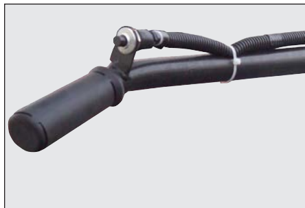
Pressing button in AWD mode prevents wheel slippage and improves traction.