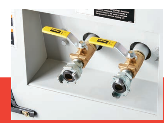
Two ¾" NPT air service connections