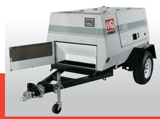
Lockable internal tool box with spacious room for multiple tools and hoses