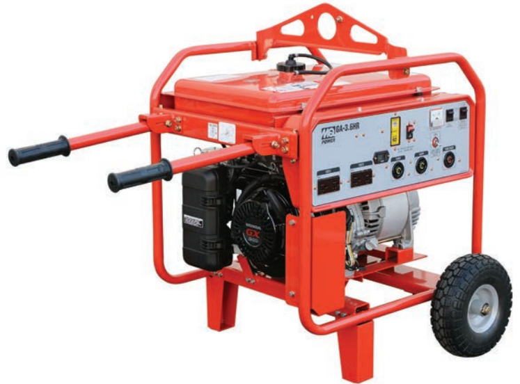
GA36HR 3600 watts max. Honda engine, recoil start