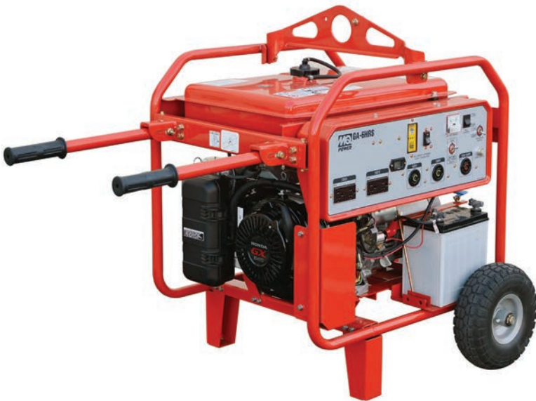
GA6HRS 6000 watts max. Honda engine, recoil/electric start Battery sold separately Battery specifications: 12N243A / MQ# 0162212024