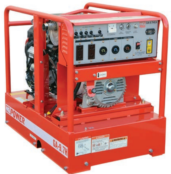
GA97HEA 9700 watts max. Honda engine, electric start Battery Specifications: 38B19R / MQ# Y0165103819