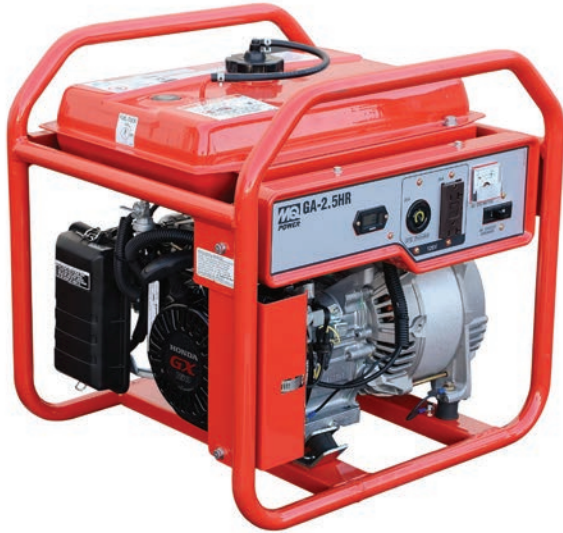
GA25HR 2500 watts max. Honda engine, recoil start

There's a size and model for every application.