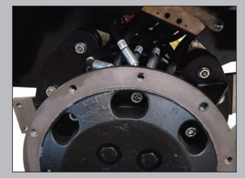
Hydraulic Hose Network Easily accessed through the drums with no special tools required. All hoses are routed to prevent wear and numbered for easy identification.