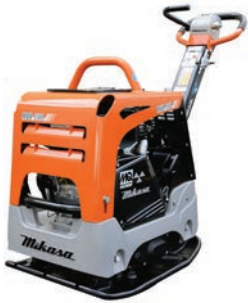
Plate size WxL in (mm) - 16.9x27.6 (430x700) Centrifugal Force lbs. (kN) - 6,070 (27) Exciter Speed VPM - 5,400 Operating Weight lbs. (kg) - 308 (140) Cyclonic Pre-Cleaner - Triple Optional Wheel Kit - WHL158