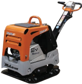
Plate size WxL in. (mm) - 19.7x28.3 (500x720) Centrifugal Force lbs. (kN) - 8,318 (37) Exciter Speed VPM - 5,200 Operating Weight lbs. (kg) - 463 (210) Max travel Speed ft/min (m/min) - 85 (26) Cyclonic Pre-Cleaner - Triple