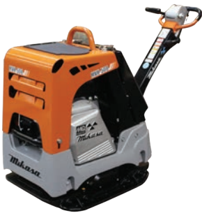
Plate size WxL in (mm) - 24x34 (600x860) Centrifugal Force lbs. (kN) - 10,116 (45) Exciter Speed VPM - 4,400 Operating Weight lbs. (kg) - 794 (360) Max travel Speed ft/min (m/min) - 79 (24) Cyclonic Pre-Cleaner - Single