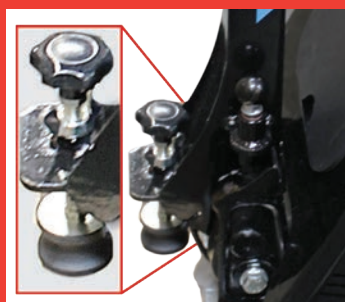
Adjustable handle height - reduce operator fatigue and improves comfort .