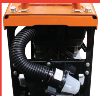
Cyclonic pre-cleaner - significantly reduces maintenance frequency and prolongs maximum efficiency of engine.