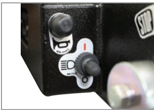
Horn and headlight switch for job-site safety