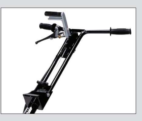
Also available with QPHAFC Folding QuickPitch<sup>™</sup> handle for easy storing (Models CA5BC and CA4HC only)