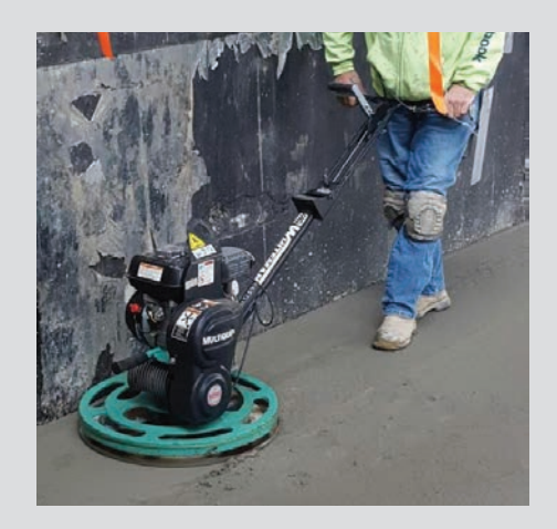
Allows finishing within 7/16" of any obstruction